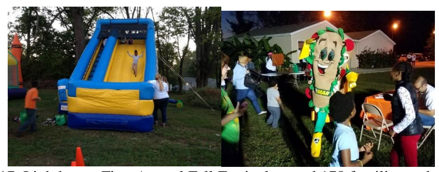
On October 13, 2017, Lighthouse First Annual Fall Festival served 178 families and gave away 116 coats. We were able to give hundreds more to a homeless shelter. We also gave away hats, scarves, gloves, purses, food, and had many booths with fun actives for families.