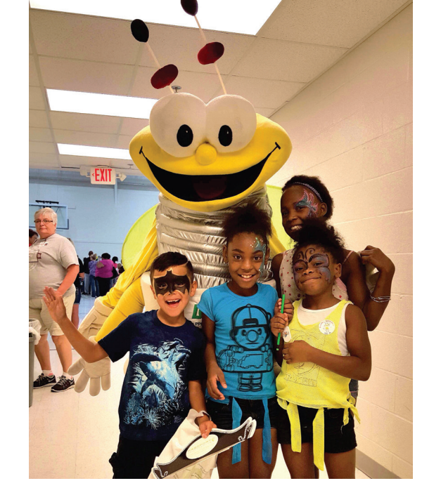
Annual Events Health and Back to School Fair