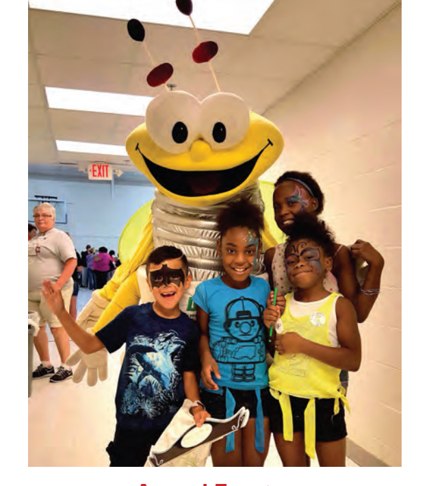
Annual Events Health and Back to School Fair